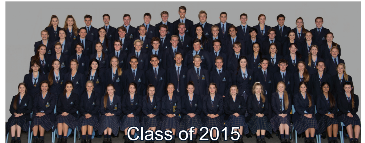
Class of 2015

100% of 2015 Faith students who made a QTAC (Queensland Tertiary Admissions Centre) application received a tertiary placement offer. Congratulations!