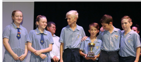
Junior School Hauser Cup winner - Coochiemudlo

Overall winner College Hauser Cup 2016 Macleay