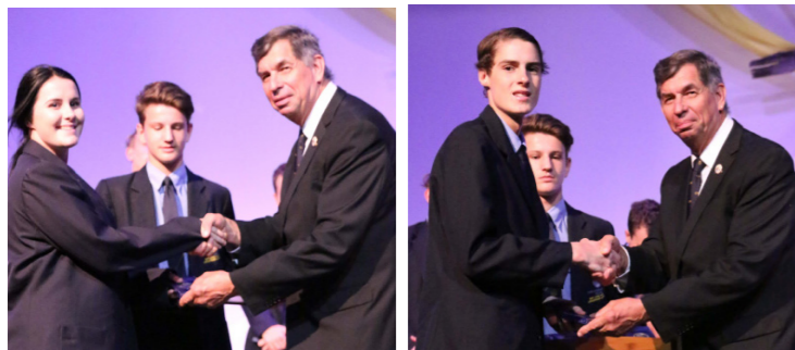
These Medallions are awarded to students who have attended Faith continuously from Prep to Year 12 (2004 - 2016)