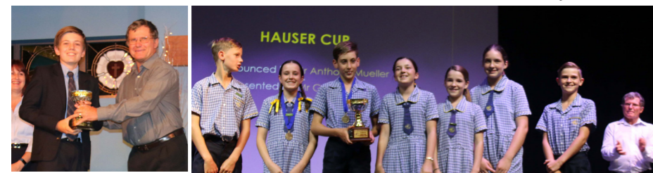
Middle School Hauser Cup winner - Macleay