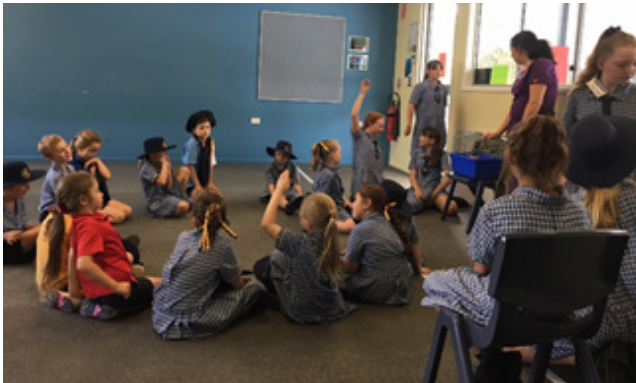
Year 1 Animal Club – visiting Vet Nurse!