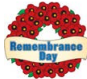
Our Choir sang beautifully at Remembrance Day Ceremony.